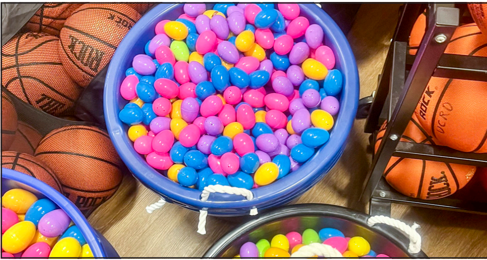
Figuratively speaking, the Sports Center is ready to hatch from all the candy-stuffed eggs the Rec Department will be bringing over to the annual Easter Hunt scheduled for Saturday.

and then 10 to 12-year-olds in an area behind the fields. Older children in attendance may cheer on their younger siblings. There may be some special “surprise” eggs for kids to find in the bunch, but regardless, there should be enough of the colorful eggs for the baskets of all children, especially since the total number has nearly doubled from last year. The Rec Department will be handing out Easter baskets to families that need them, and people are asked not to bring 5-gallon buckets, please. But wait – there’s more. Each participating child will get the opportunity to receive See Easter Egg Hunt, Page 3A