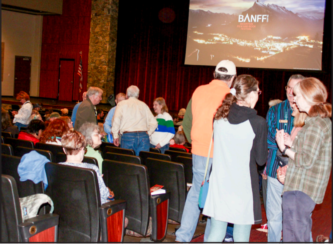
The Banff Film Festival’s inaugural outing in Blairsville was such a success that there are already plans for it to return next year.

By Brittany Holbrooks North Georgia News Staff Writer On March 29, the Georgia Appalachian Trail Club’s annual screening of the Banff Centre Mountain Film Festival World Tour came to Blairsville for the first time, showcasing a love of the outdoors through masterful visuals and evocative storytelling. Along with GATC, 23 partners set up tables in the lobby of the Union County Schools Fine Arts Center that Saturday to showcase organizations and programs that benefit the natural spaces that surround the community and protect local trails and See Banff Centre, Page 6A