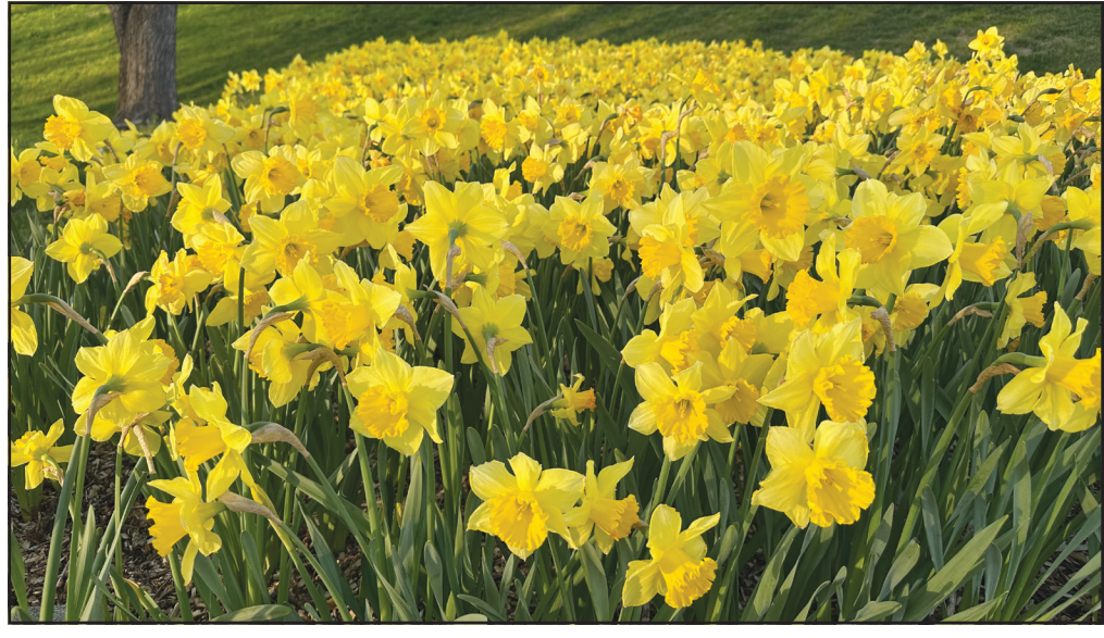
Officially part of the Worldwide Daffodil Project, the beautiful Children's Daffodil Garden planted in memory of the child victims of the Holocaust is in full bloom in the park behind Blairsville City Hall.